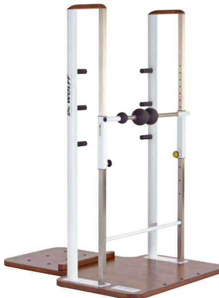
BACK & NECK 416