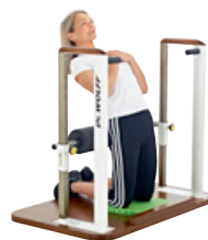
Posterior thigh / calve