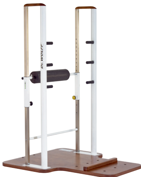
LAT & ARM 413